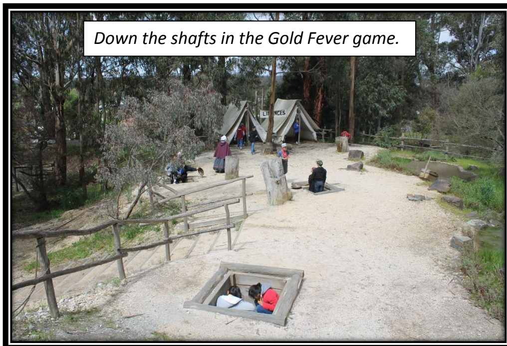
Down the shafts in the Gold Fever game.