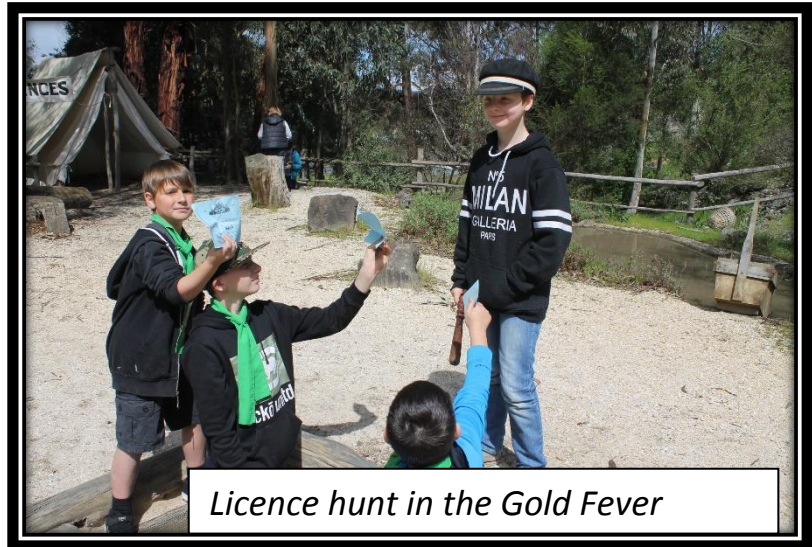
Licence hunt in the Gold Fever